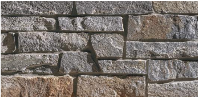
▲ Cortland Ledgestone