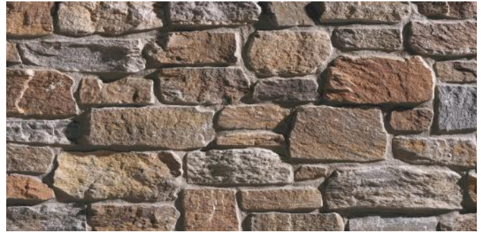
■ Woodbridge LedgeStone

Heights: 1.5" to 5.5" Lengths: 3.5" to 24"