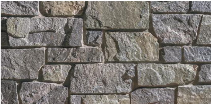
■ Emerald Lake Rustic Ashlar Available While Supplies Last