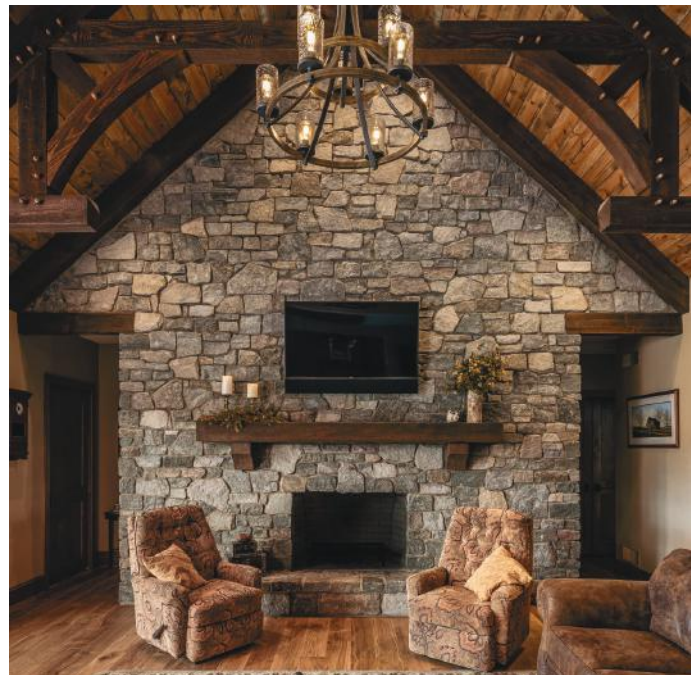
Rockland Homestead Rubble