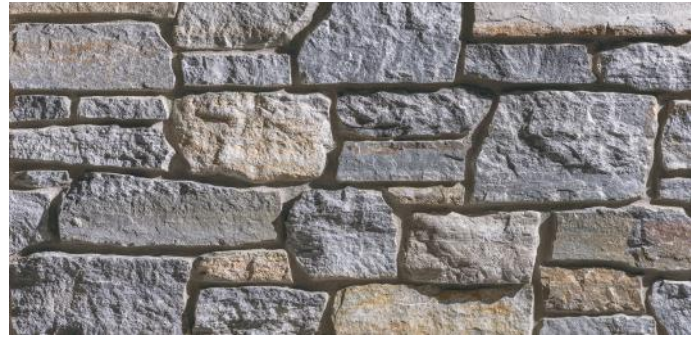
■ Silver Bay LedgeStone