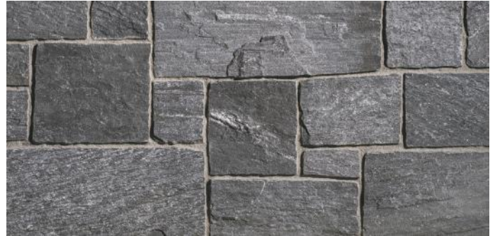
■ Charcoal Ridge Rustic Ashlar