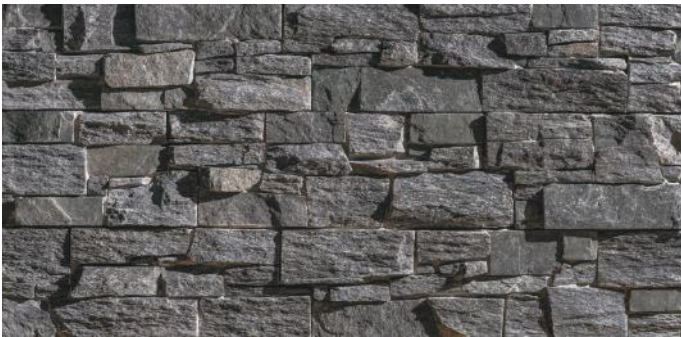
Rocky Mount StackedPanel

Each StackedPanel piece comprises multiple stones that have been adhered to a mesh back in a staggered "staircase" layout. The design allows the product to be installed quickly and provides an intricately detailed style. Loose filler pieces are available to fill in small gaps at the end of courses. StackedPanel is designed to be installed in a dry-stacked style.