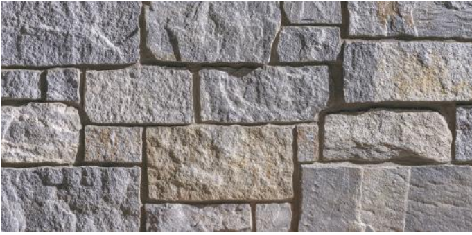
Silver Bay Rustic Ashlar