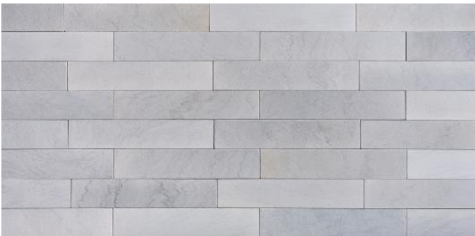
■ Arctic Grey MetroFit

With clean lines and smooth texture, MetroFit adds an elegant and modern appeal to any space. All sides are sawn, and the face of each piece is lightly textured for a luxurious appearance. Each piece is 6" high, 30" wide, and 22mm thick, allowing for easy installation and a consistent appearance.