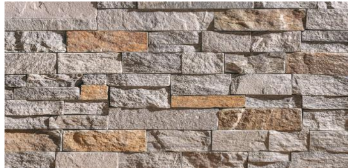
■ Diamond Point Ledgestone