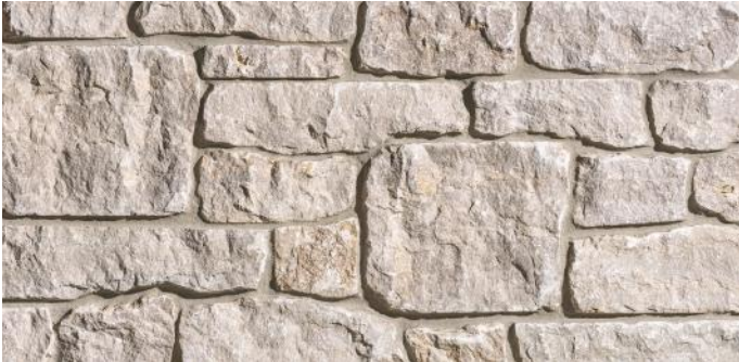
▲ Amarillo Rustic Ashlar

Rustic Ashlar features pieces that are mainly square or rectangular with a few angled or curved edges. The pieces tend to be larger and more square than LedgeStone and are typically installed with a mortar joint.