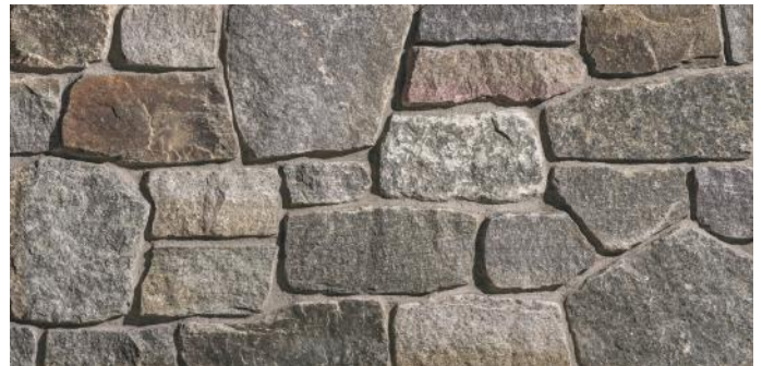
Rockland Homestead Rubble