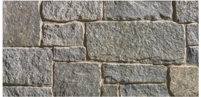
▲ Deep River Castle