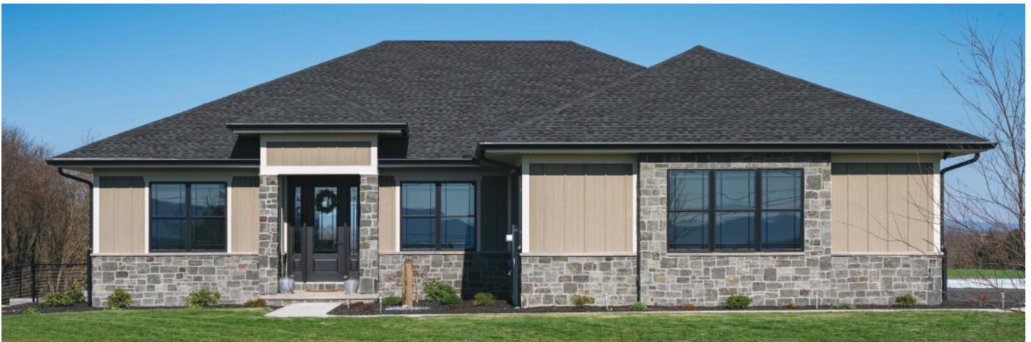
Deep River Castle

Heights: 6" to 12.5" Lengths: 8" to 21.5"