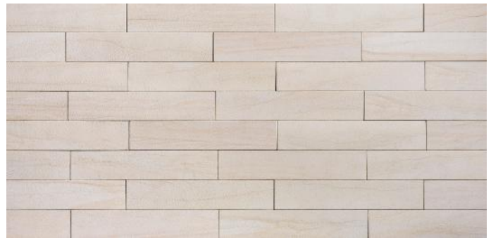
■ Yorkshire MetroFit