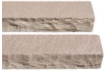
Autumn Brown Sills

Header Size: 8" High, 22" Wide, 1" Thick Sill Size: 2.5" Deep, 36" Wide, 2" Thick Sills have 5 sawn edges and 1 rockfaced edge.