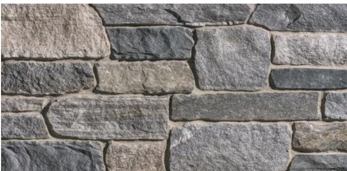
▲ Holston Valley Rustic Ashlar