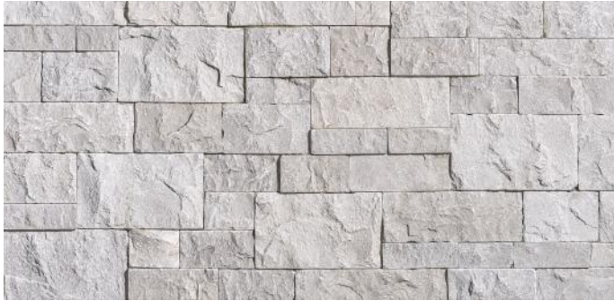
Everest Dressed Ashlar

Dressed Ashlar features rectangular pieces with clean lines and smooth edges. Its rough textured surface creates a natural, weathered appearance. It has a mix of pre-selected sizes, allowing for easier installation with minimal cutting. It is often installed in a dry-stacked style, but it can be installed with a mortar joint.