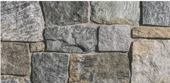
▲ Hudson Gorge Castle