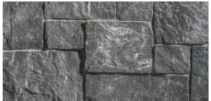
■ Plymouth Castle

Heights: 6" to 12.5" Lengths: 8" to 21.5"