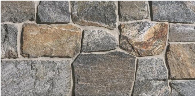
▲ Cortland Castle

Castle features large format square and rectangular pieces. It is typically installed with a mortar joint, but it may be installed in a dry-stacked style with additional cutting and fitting.