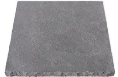
Summit Blue Hearthstone 20" Wide, 20" Deep, 1.5" Thick 4 Rockfaced Edges

Mantel: 10" Deep, 60" Wide, 2" Thick, 4 Rockfaced Edges Mantel Bracket: 7" Deep (Top), 2.5" Wide, 11" Tall, 5 Sawn Edges and 1 Rockfaced Edge