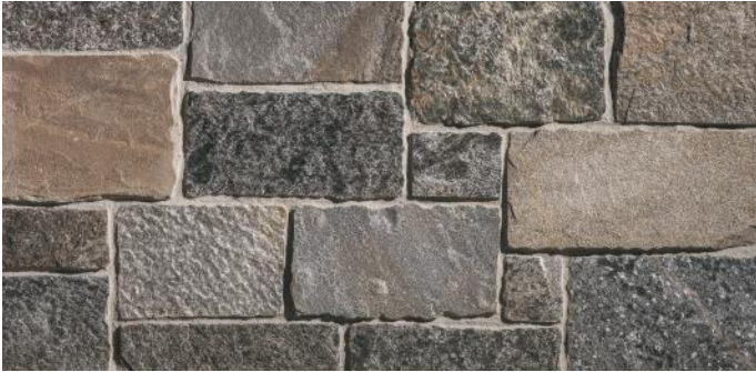
Winter Harbor Rustic Ashlar Available While Supplies Last