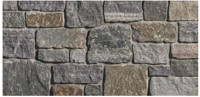
Thunder Bay Rustic Ashlar