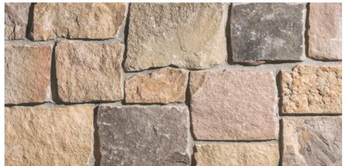
▲ Elkton Ridge Rustic Ashlar