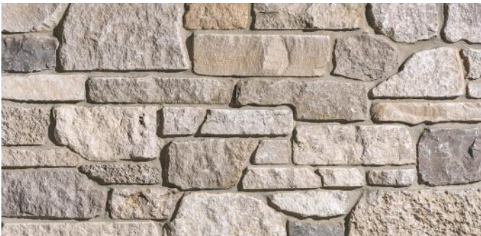
▲ Grayhawk Ledgestone