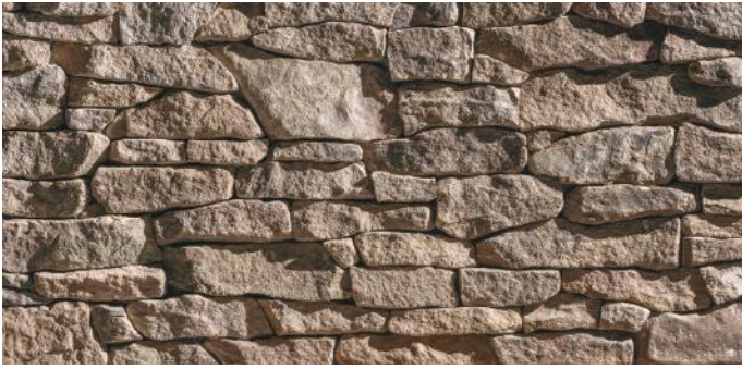
▲ Stony Point LedgeStone

Heights: 1.5" to 5.5" Lengths: 3.5" to 24"