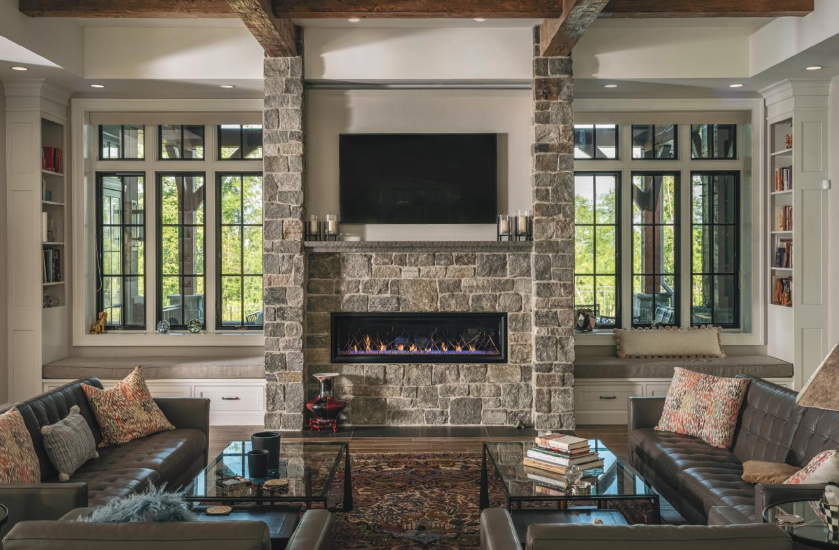
Blend: 75% Deep River Castle, 25% Thunder Bay Rustic Ashlar