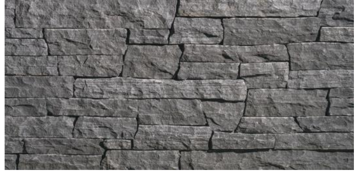
■ Charcoal Ridge Ledgestone