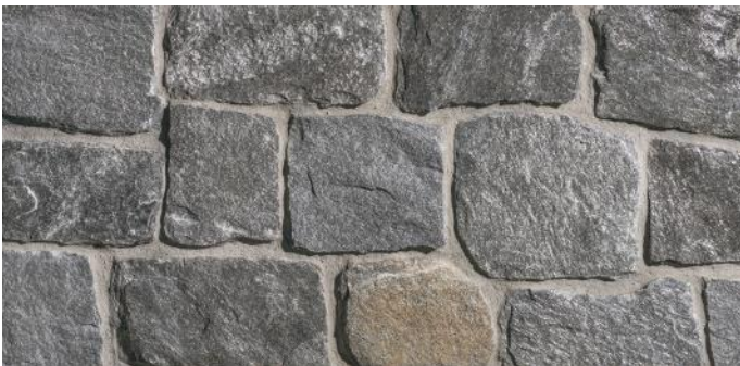
▲ Newport Castle