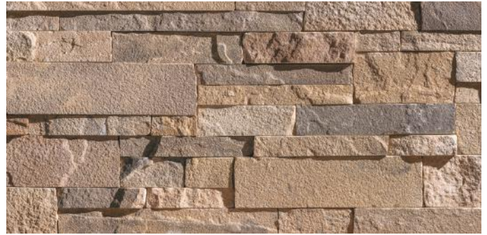
Copper Canyon PrecisionLedge