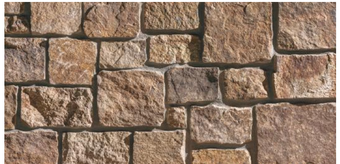
■ Granite Falls Rustic Ashlar