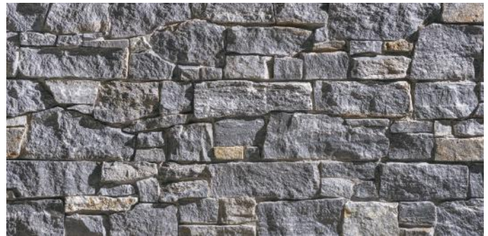
Silver Bay StackedPanel

Height: 7.875" Length: 23.5" (With 2" Instep)