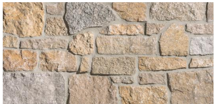
▲ Maple Grove Rustic Ashlar

Heights: 2" to 10.5" Lengths: 5.5" to 15"