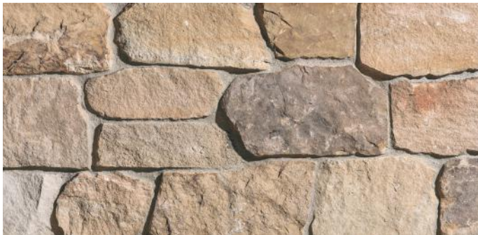
Elkton Ridge Homestead Rubble

Homestead Rubble is a unique blend of several styles of stone, including mosaics, ashlar, and ledgerstones. It can be installed with a mortar joint or in a dry-stacked style, but additional cutting and fitting may be required in a dry-stacked application.