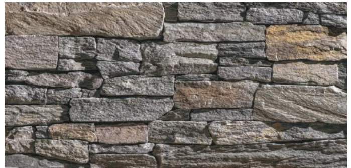
■ High Point Ledgestone