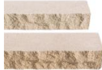
Sedona Buff Sills