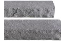
Summit Blue Sills