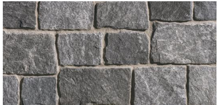
▲ Manchester Castle