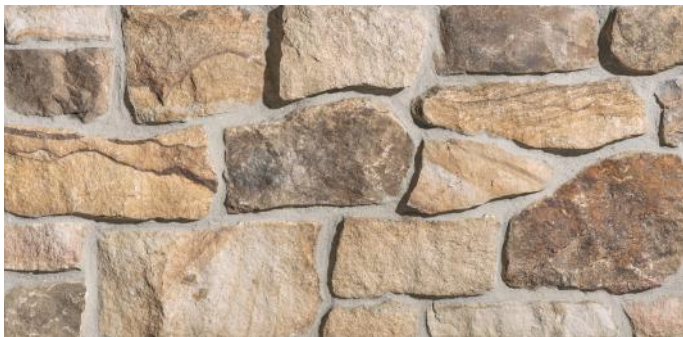
Stony Point Homestead Rubble