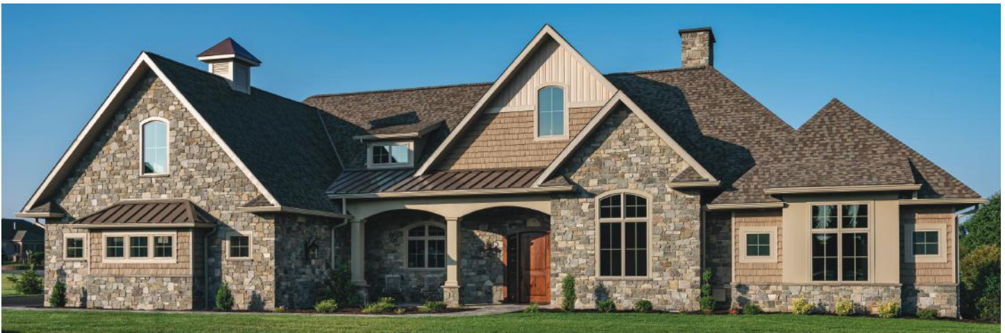
Rockland Homestead Rubble