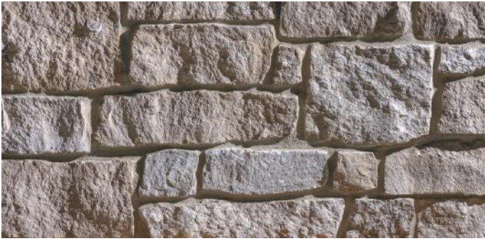
▲ Sheridan LedgeStone