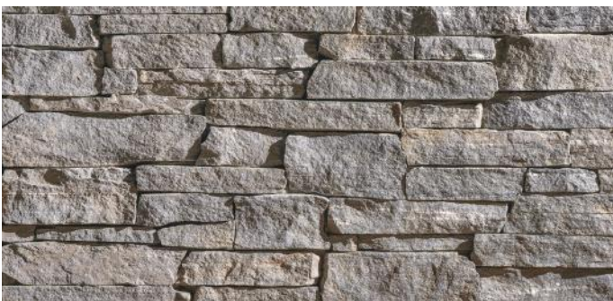
■ Kingston Ledgestone