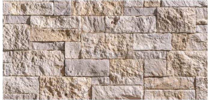
Lafayette Dressed Ashlar Featured on Front Cover

Heights: 2", 3", 4", 6" Lengths: 4" to 16"