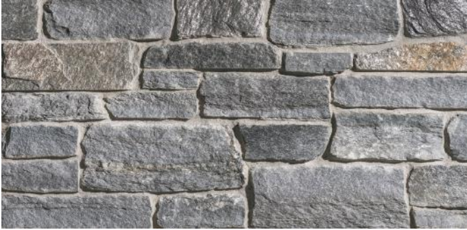
▲ Bar Harbor Ledgestone

Ledgestones vary greatly in appearance, but they are generally characterized as long narrow pieces. They can be installed with a mortar joint or in a dry-stacked style, but additional cutting and fitting may be required in a dry-stacked application.