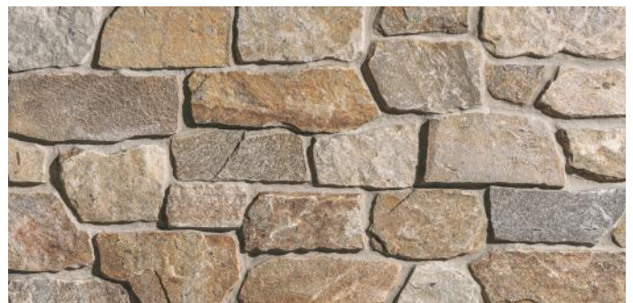
▲ Locust Creek Ledgestone