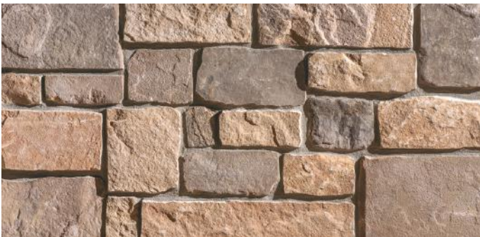
■ Copper Canyon Rustic Ashlar