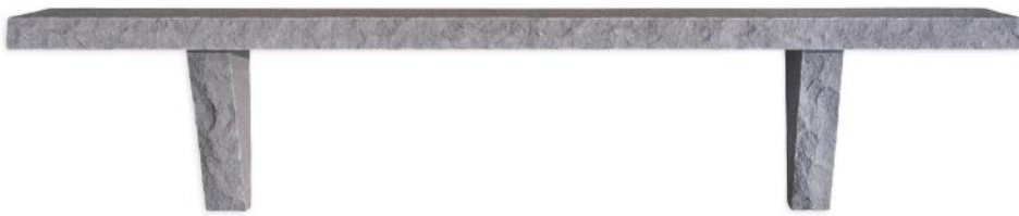
Summit Blue Mantel & Mantel Brackets

Mantel: 10" Deep, 60" Wide, 2" Thick, 4 Rockfaced Edges Mantel Bracket: 7" Deep (Top), 2.5" Wide, 11" Tall, 5 Sawn Edges and 1 Rockfaced Edge