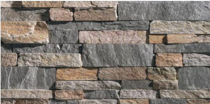
Iron Mountain PrecisionLedge